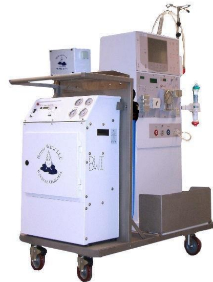
Shown with both a PB2 and a dialysis machine mounted to an extended cart