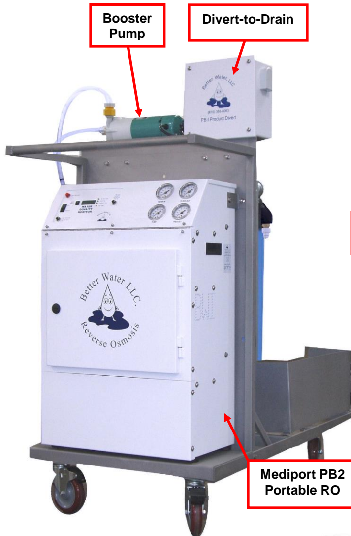
Rear View – Extended Cart