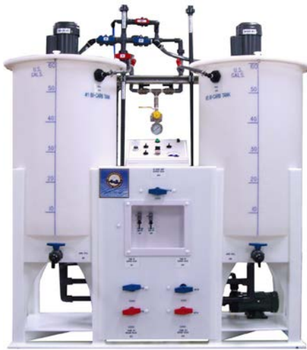
60 Gallon Bicarb