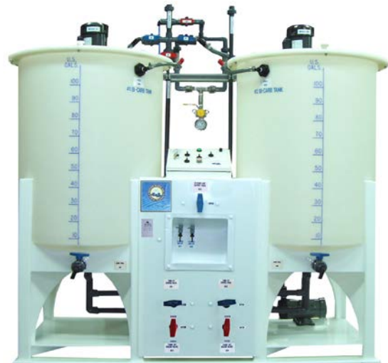
100 Gallon Bicarb