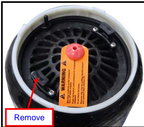
1. Remove LOCK RING