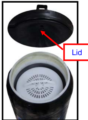
2. Remove LID