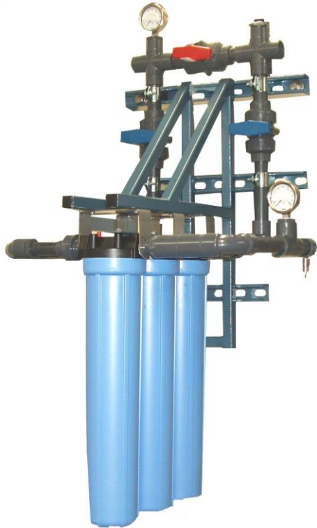
System in picture shown with 3 filter cartridges