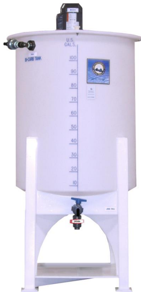
100 Gallon Bicarb