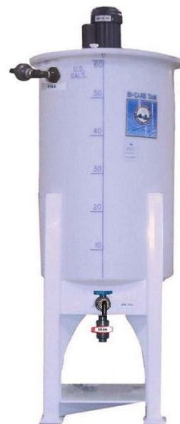
60 Gallon Bicarb