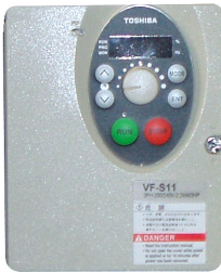
Old Model VFD White/Cream color with hinged cover Front View

Better Water LLC's part number of EQMOBO01353 which is the " 3 Phase-In / 3 Phase-Out / 3 Horsepower VFD " will remain the same. The difference between these two models is mostly cosmetic. See the pictures below of the old and new models.