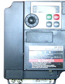
New Model VFD Black color, no hinged cover Front View