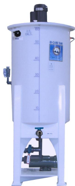
60 Gallon Bicarb