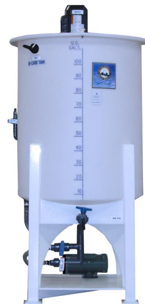
100 Gallon Bicarb