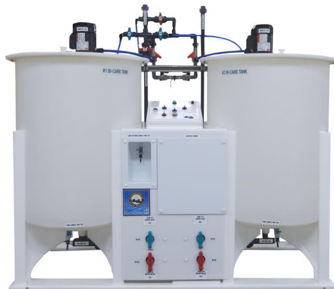
100 Gallon Bicarb