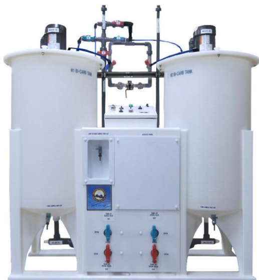
60 Gallon Bicarb